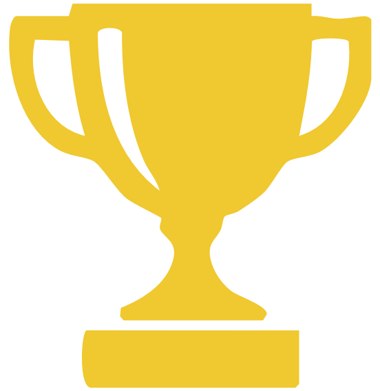
KS2 - Samar Y4