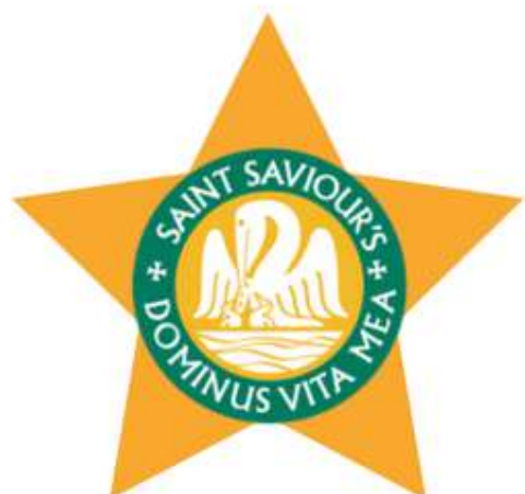
Year 5 Demid & Markus