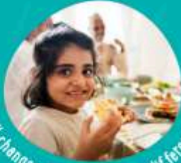
Small changes that make a big difference