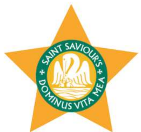
Year 4 Clay & Celeste