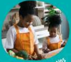
Healthy eating tips

12-week Beezee Families courses starting 21st April 2025