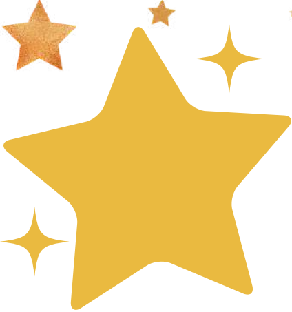
Y4: Khalish & Kasper