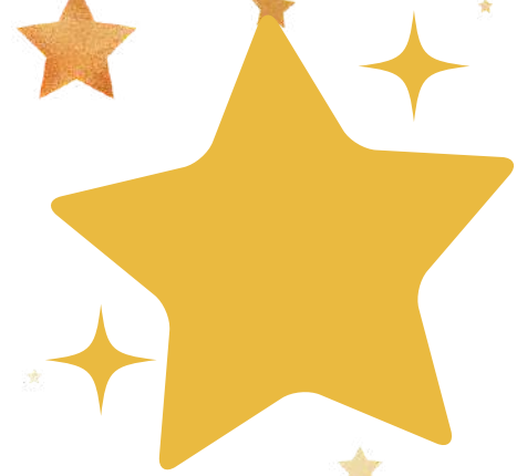
Y3: Apollo & Sid