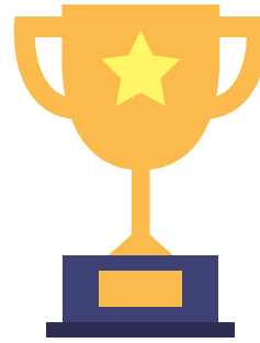
Progress Winner Sid Y3